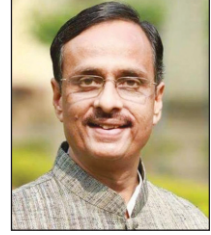
Dr. Dinesh Sharma Deputy Chief Minister Uttar Pradesh